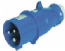
IEC60309 32A 2P+E plug