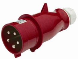
IEC60309 32A 3P+N+E plug